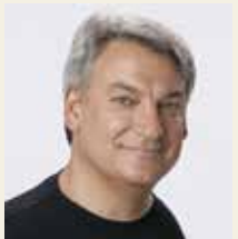
Dave Dravecky, Co-Founder of Endurance and Former Major League Baseball Player

Drawing from his personal experience with cancer, Dave Dravecky, a former Major League pitcher and nationally-recognized motivational speaker, will share what he has learned about the meaning of success versus significance and how to find encouragement through adversity. Dave will describe how the power of your team can be an important asset in an age of austerity and fewer resources. By examining relationships with your co-workers, teams and benefactors, he will define how you can discover your true worth.